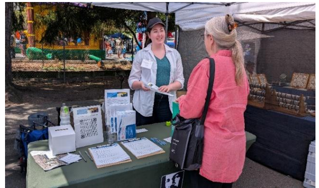
A member of the outreach team shares information with a festival attendee.