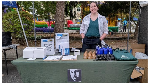
At the event the outreach team distributed project information and swag.

Staff shared project information. They also handed out paper copies of the Community Value Survey and the project FAQ. Materials were available in English and Spanish. The team gave out King County-branded swag. Booth visitors played a "Flush it or Trash it" game to learn how their choices can make a big impact.