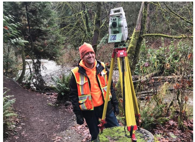
Survey crews will use handheld survey equipment to gather data at approximately 30 locations.