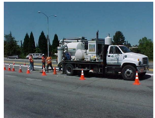
Example of a vacuum truck used for utility location.