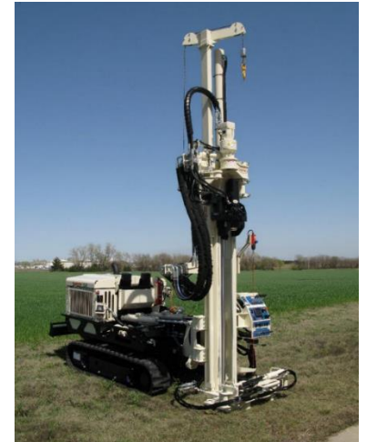
Example of typical equipment used for geotechnical surveys.