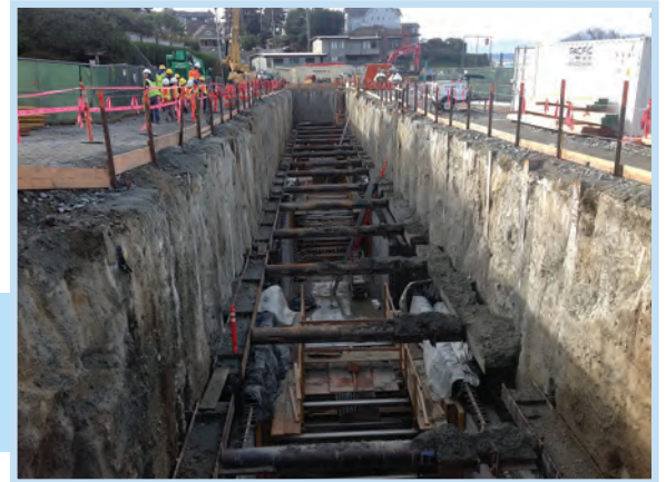
View from inside the CSO tank as it is being built.

The contractor modified the work plan to avoid additional time needed to reopen then close the intersection of N.W. Blue Ridge Drive and N.W. Triton Drive. They will now open the road in early June for limited vehicle and pedestrian traffic while work adjacent to the road is completed. The road is expected to fully reopen by the end of July.