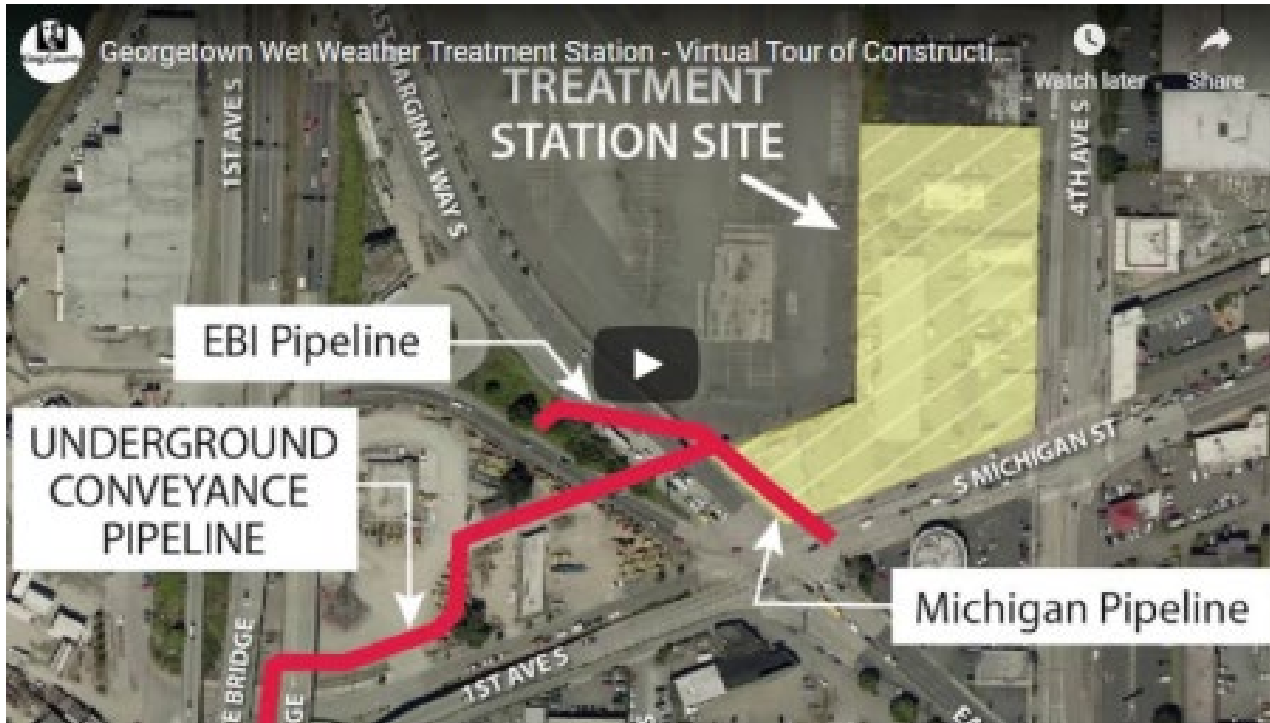
The Georgetown Wet Weather Treatment Station Virtual Tour Video