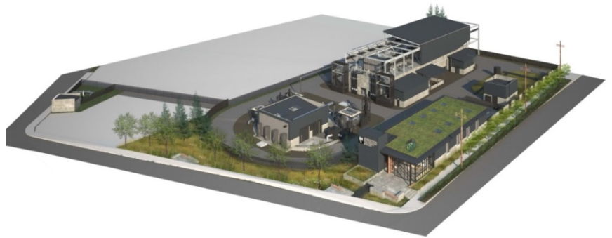
Bird's eye view from corner of 4th and Michigan