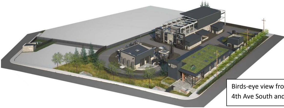
Birds-eye view from the corner of 4th Ave South and S Michigan St.

The Georgetown Wet Weather Treatment Station project is expected to reach the 30% design milestone in early March 2016. By 30% design, the wet weather treatment station site layout and conveyance route to the river will be decided, and major architecture and landscaping elements are in place. Below are two interim designs.