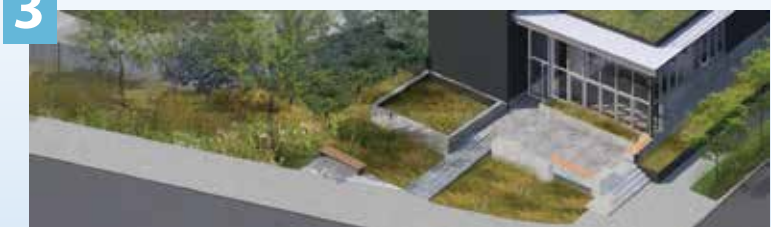
Almost everything on site plays more than one role in supporting facility operation, enhancing the environment, and/or adding to the aesthetics of the site. Cisterns will collect and store stormwater to supplement irrigation, and rain gardens will provide much needed green space while cleaning stormwater that falls on site.

DESIGN PRINCIPLE FROM DAG: 3 Create a facility that is environmentally and socially sustainable