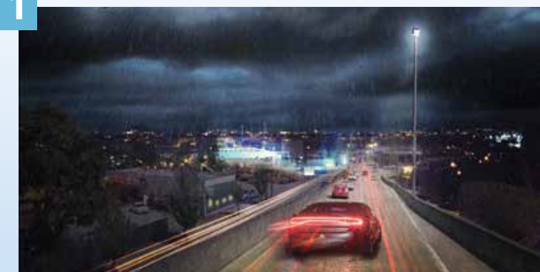
What a car traveling south on SR 99 might see on a rainy night as the facility lights up to show that it is cleaning water heading for the Duwamish River

DESIGN PRINCIPLE FROM DAG: 1 Make the natural and treatment processes plainly visible.