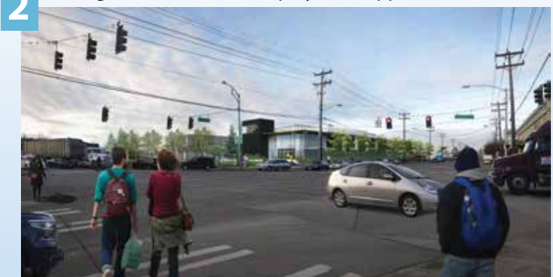
The Operations and Maintenance meeting room will also serve as a stormwater education center for the Wastewater Treatment Division and its partners.

DESIGN PRINCIPLE FROM DAG: 2 Enhance the understanding of public wastewater infrastructure through education and employment opportunities.