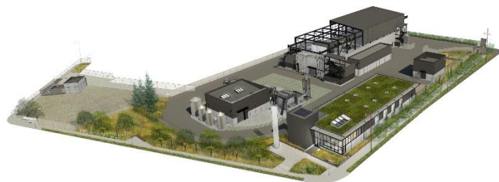
A rendering of the treatment station highlighting the green roof, rain gardens, and new trees to be installed.

The new landscaping, green roof, and efforts to control stormwater on the station site were of particular interest to attendees! Installation of new trees, green roof, and cisterns and rain gardens will help ensure the station promotes environmental and social sustainability.