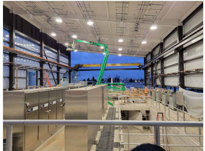
A look at construction progress inside the treatment station.