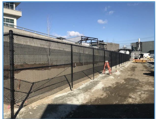
In February crews installed the final fencing around parts of the treatment station site.

Construction of the treatment station continues. Much of the work is taking place inside the new station buildings. Outside, crews are continuing to build planting areas, permeable pavement areas, and other outdoor features. Community members may have seen some of the permanent fencing going up on the site.