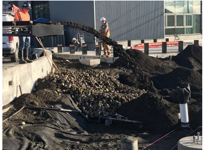
Crews used a telebelt to place mixed soil in the future planting areas

Construction of the treatment station continues. Much of the work is taking place inside the new station's buildings. Outside, crews are placing final soil for planting areas, installing irrigation systems, building permeable pavement areas, and completing other outdoor features.