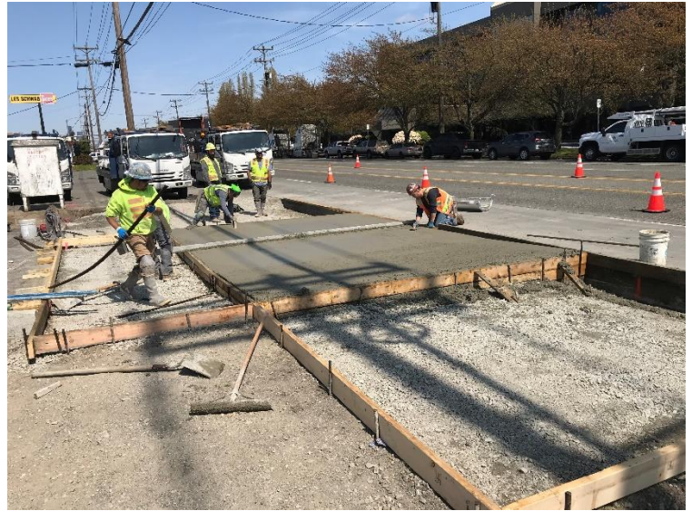
Crews form and pour new concrete on 4th Avenue South.

At the beginning of the project, King County set a goal to divert 85 percent of the waste from construction and demolition of the Georgetown Wet Weather Treatment Station from the landfill. Throughout the project we have tracked how much we are able to divert to meet our goals. One of the unique items King County was able to salvage during demolition was wooden beams made from old growth timbers which are no longer made.