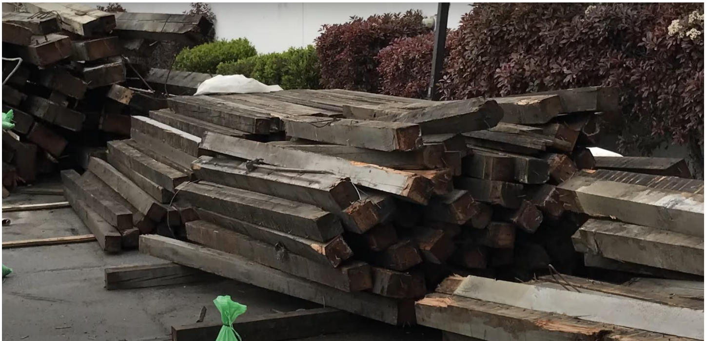
Old growth timbers salvaged during demolition.

Visit the project website: www.kingcounty.gov/GeorgetownWWTS