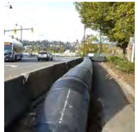
Your wastewater service will be maintained during construction by a temporary pipe. This pipe will be routed above ground along streets and underground in some locations.