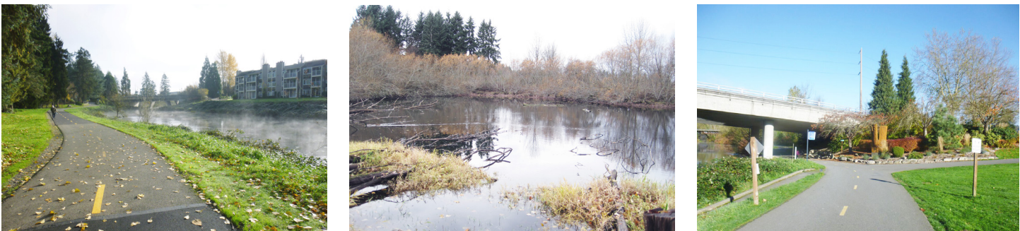
Photos from left to right: Apartments and Condos along the Sammamish River Pond along W. Lake Sammamish Pkwy Sammamish River Trail at Luke McRedmond Landing

The project will replace about 21,000 feet of sewer pipe extending from the Idylwood Neighborhood to Redmond City Hall, running along West Lake Sammamish Parkway and the Sammamish River Trail. The new sewer will provide service for your community for 50 years or more.