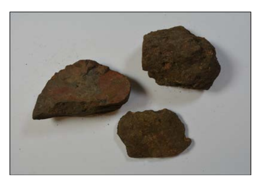
Artifacts discovered by the project team near Marymoor Park are more than 5,000 years old.

WTD's Environmental Planning team supports the County's award-winning Historic Preservation Program.