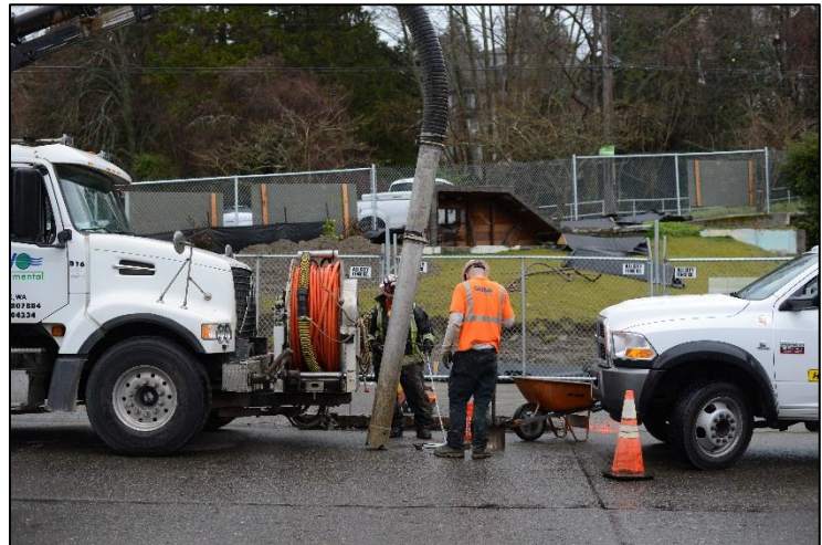
Crews will use a vacuum truck to confirm utility locations

Crews will work from north to south (see map on reverse page for more detail). At each location, crews will dig a hole in the ground, called a pothole, approximately one foot in diameter. Crews will use a vacuum truck to remove the soil and safely expose the utility. Expect increased noise while the vacuum truck is in use. After each pothole is completed, crews will fill the hole and restore the pavement or ground surface.