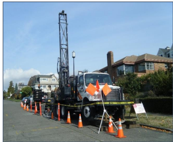
Crews will use a truck-mounted drill rig to take soil samples along the roadway.

Please watch for equipment and signs in the area, travel slowly to stay safe, and follow direction from flaggers.