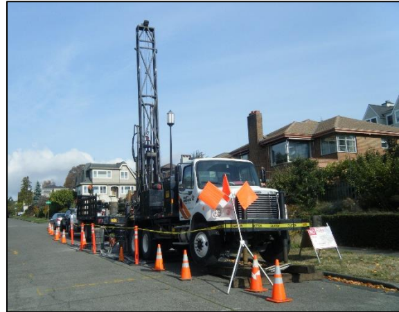
Crews will use a truck-mounted drill rig to take soil samples along the roadway.

Crews will take samples at 35 locations on the Sammamish River Trail near Marymoor Park and Luke McRedmond Park, on West Lake Sammamish Parkway, and on 179th, 177th and 180th avenues (see map below). The trail will remain open during the soil sampling activities. About half of the samples will require temporary sidewalk or lane closures. Expect short delays while this work is underway.