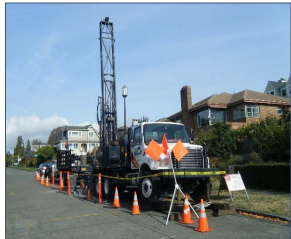
Crews will use a truck-mounted drill rig to take soil samples along the roadway.

Please watch for equipment and signs in the area, travel slowly to stay safe, and follow direction from flaggers.