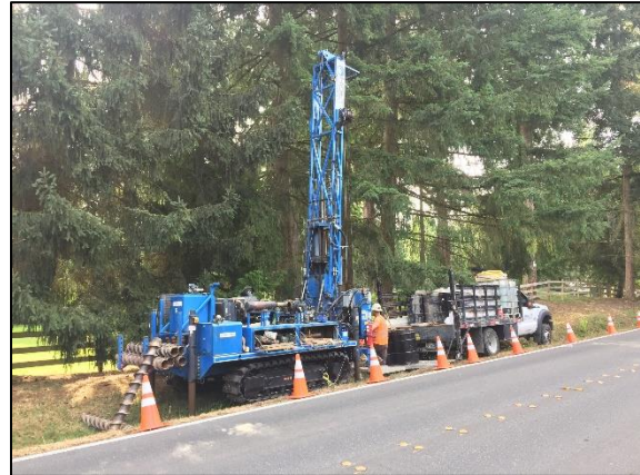
Crews will use a rubber-tracked drill rig to take soil samples along the trail.