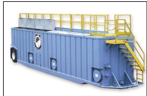
Crews will use a tank to store groundwater during testing before discharging back into the sewer.

King County needs to upgrade about 4.5 miles of sewer line between NE 85th Street and the Idylwood neighborhood to meet the needs of the growing Redmond and Bellevue communities as the existing sewer line nears the end of its service life. Construction for the pipeline is scheduled to begin in 2020.