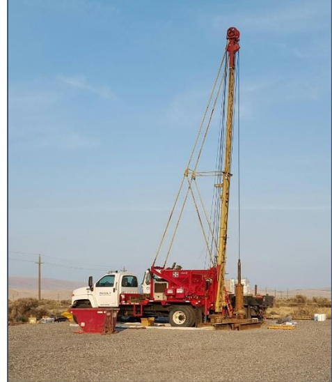
Crews will use a cable tool drill rig to install the well and perform testing.