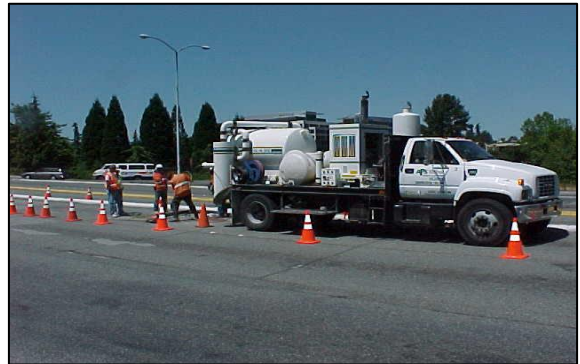
Typical vacuum truck used for potholing work

Crews will generally move from north to south.