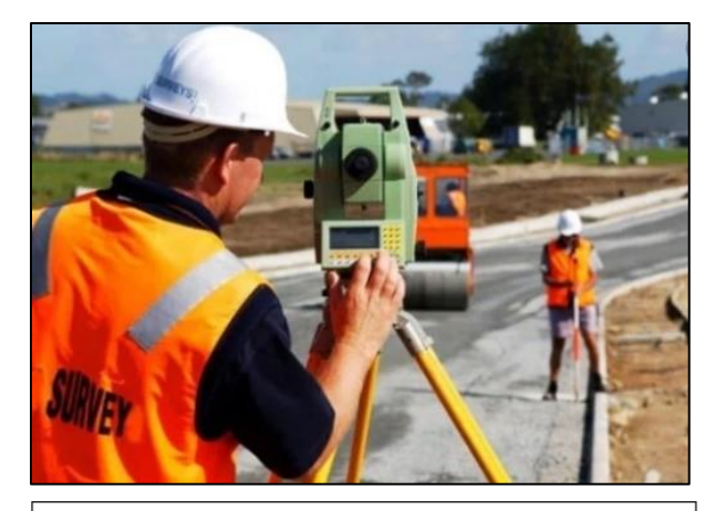
Crews will wear personal protective equipment that includes a face mask.

Please watch for equipment and signs in the area, travel slowly to stay safe and follow direction from flaggers.