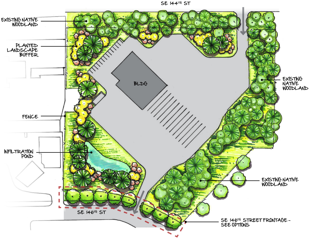
Initial site landscape design concept

As part of the project, King County will plant new trees and landscaping on the project site. The County will also keep many of the existing trees, as required by the City of North Bend, around the perimeter of the facility. Below is a landscape design concept that illustrates where existing trees will be kept and where new plants will be installed.