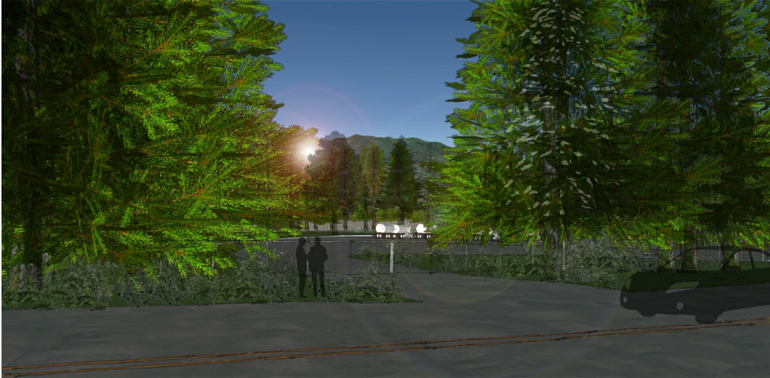
Looking into the site from S.E. 144th Street