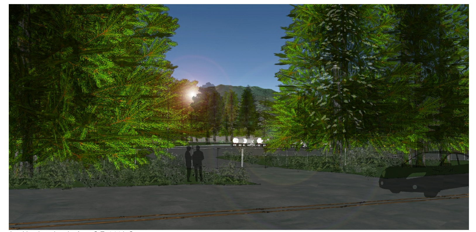
Looking into the site from S.E. 144th Street