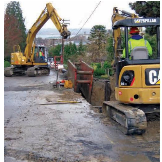
Example of crews securing an open-cut trench to prepare for pipe installation.

Read below for more on the schedule and see the reverse for what to expect during residential roadway construction.