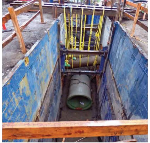
Excavations to install the pipe for this project range in depth from 15 – 30 feet. Do not approach open excavations for your safety and the safety of our crews.