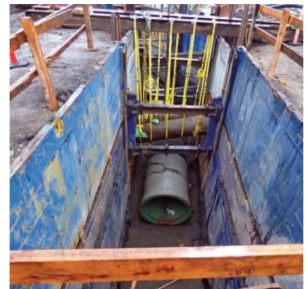
Excavations to install the pipe for this project range in depth from 15 – 30 feet. Do not approach open excavations for your safety and the safety of our crews.

ALTERNATIVE FORMATS AVAILABLE: 206-477-5371 / 711 (TTY Relay)