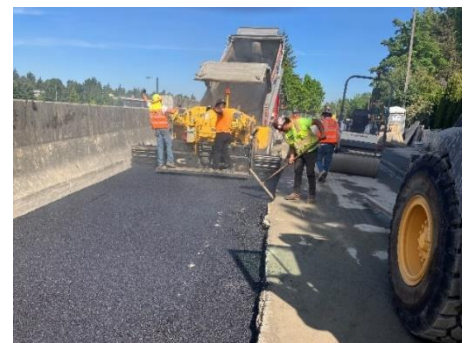
Paving restores the road for safe passage after construction.

Permanent pavement needs a few hours to cure. During paving, crews may need to close the road and re-direct traffic around the area. During this time, driveways will be temporarily inaccessible while the pavement is curing. We expect driveways to be closed for about three to four hours while pavement is curing.