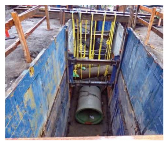
Excavations to install the pipe range in depth from 15 – 30 feet. Do not approach open excavations for your safety and the safety of our crews.