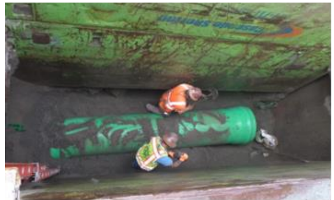
Crews install pipe deep underground via "open cut" construction.