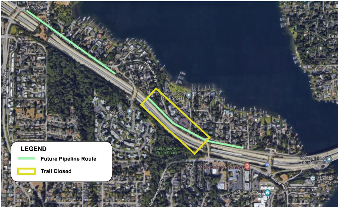
The trail will be closed for approximately six months between Shorewood Drive and SE 35th St.