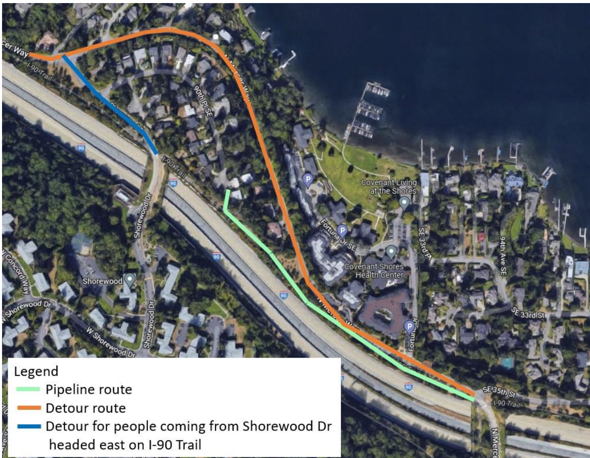
This image shows the detour route during construction on the I-90 trail. Follow the blue route if you are traveling eastbound from Shorewood Drive.