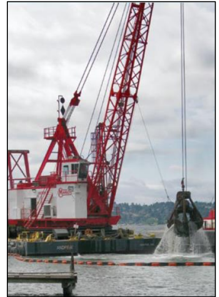
A barge-mounted crane removing materials from the lakebed.

In-water construction is planned to last through early 2024. For more details, check out our East Channel fact sheet .