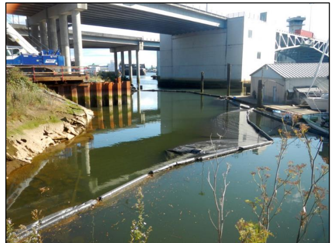
Example of environmental protections

Boaters should be aware of navigational aids and use extreme caution while moving through the work area.