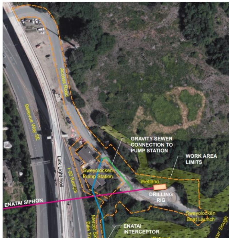
Sweyolocken boat launch and pump station site during construction of the Enatai Siphon connection