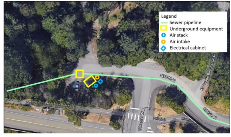
Approximate locations of the above and below-ground structures that will support future operations.

Parking will be restricted in the cul-de-sac on SE 35th PL while crews work in this area. We will partially close SE 35th PL between E Mercer Way and Frontage Road. Residents