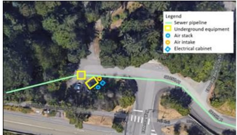
Approximate locations of the above and below-ground structures that will support future operations.

Pedestrian and bike access to the Mercer Island Boat Launch will be closed during construction on SE 35th PL. The I-90 Trail will remain open to the south of SE 35th PL.