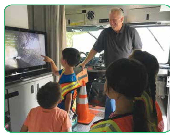
King County's Carson Cox teaches kids about the wastewater system at the Mercer Island Summer Celebration.

For more information about our system, visit <a href="https://www.kingcounty.gov/environment/wtd">www.kingcounty.gov/environment/wtd</a>