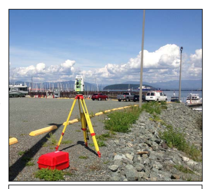
Crews will use total stations to take survey readings.

Please note that dates could shift depending on work conditions.