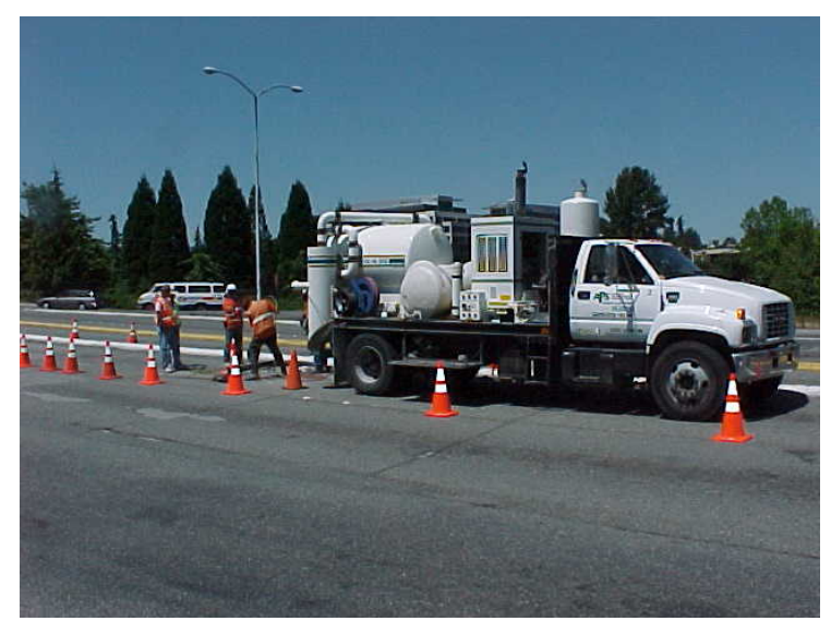
Vacuum truck at work

See map on reverse for exact locations of potholes.