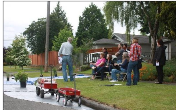
King County staff hold neighborhood “walk and talks” to help residents understand how projects will affect their street.