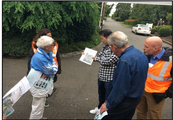
A member from the project team sharing project plans with local neighbors at 97th Avenue S.E.

We expect the contractor to install up to 40 feet of pipe per day, on average. We expect it will take up to approximately 2 to 3 months to install the pipe along 97th Avenue S.E., and approximately 3 to 4 months along S.E. 35th Place to the water. Lift Station 11 improvements will take 6 to 12 months, pending discussions with the City of Mercer Island.