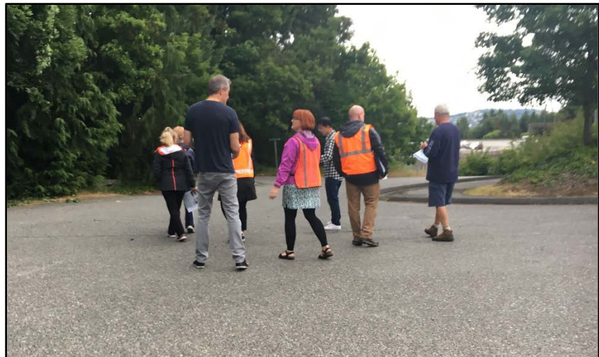
Project team and local neighbors walking S.E. 35th Place.

No. Maintenance crews replace activated carbon units regularly to ensure that the system is working optimally. If there were ever a problem, King County maintains a 24-hour odor control hotline.