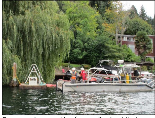
Crew members working from a dive boat that powers a hose used to expose underwater structures.

Later this month, crews will return to inspect maintenance holes just off the shoreline and perform in-water survey work along the Enatai and Mercer Island shorelines. This work will help our team understand the condition of the project area and features near the shoreline. King County