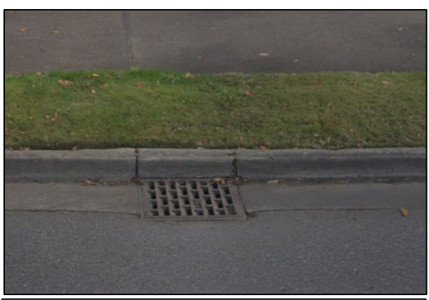
Crew members will remove and replace storm drain covers to conduct the analysis.