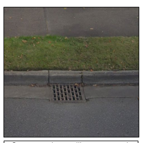
Crew members will remove and replace storm drain covers to conduct the analysis.