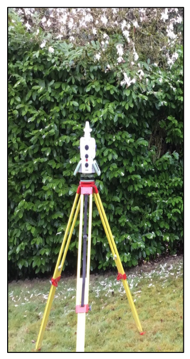
Crews will use survey equipment to measure and photograph trees.