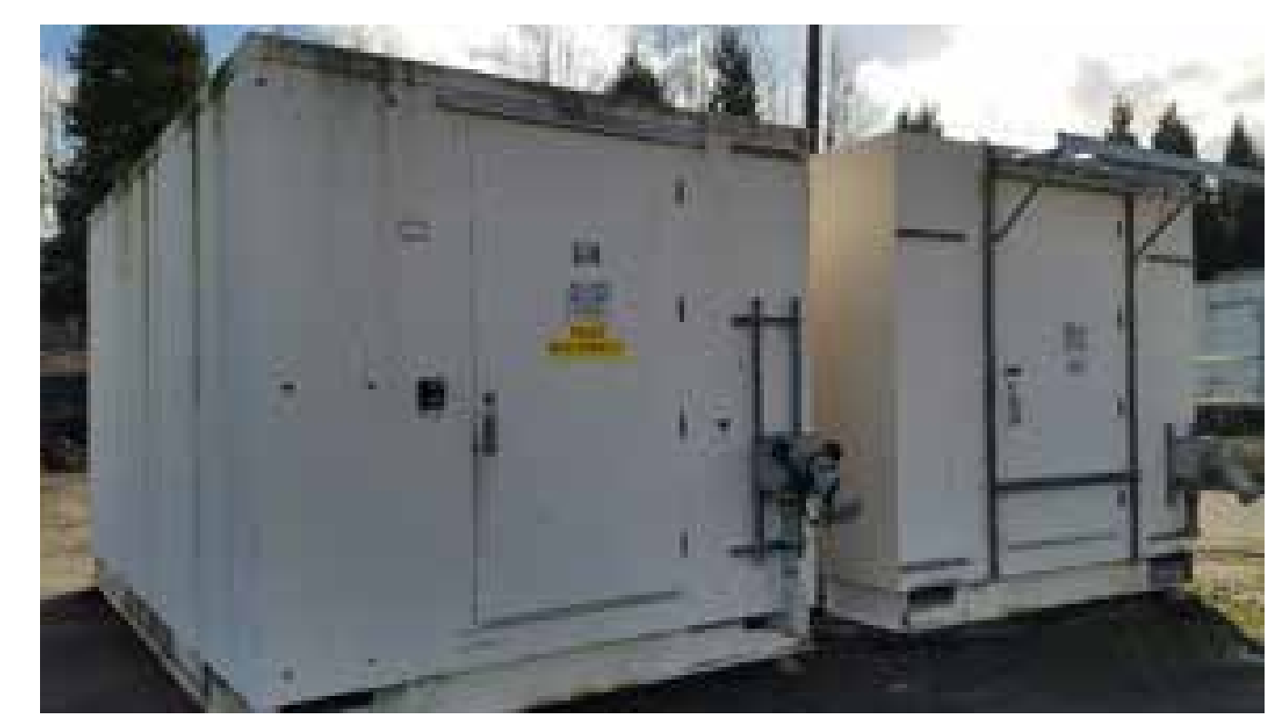
Power & Controls Trailers