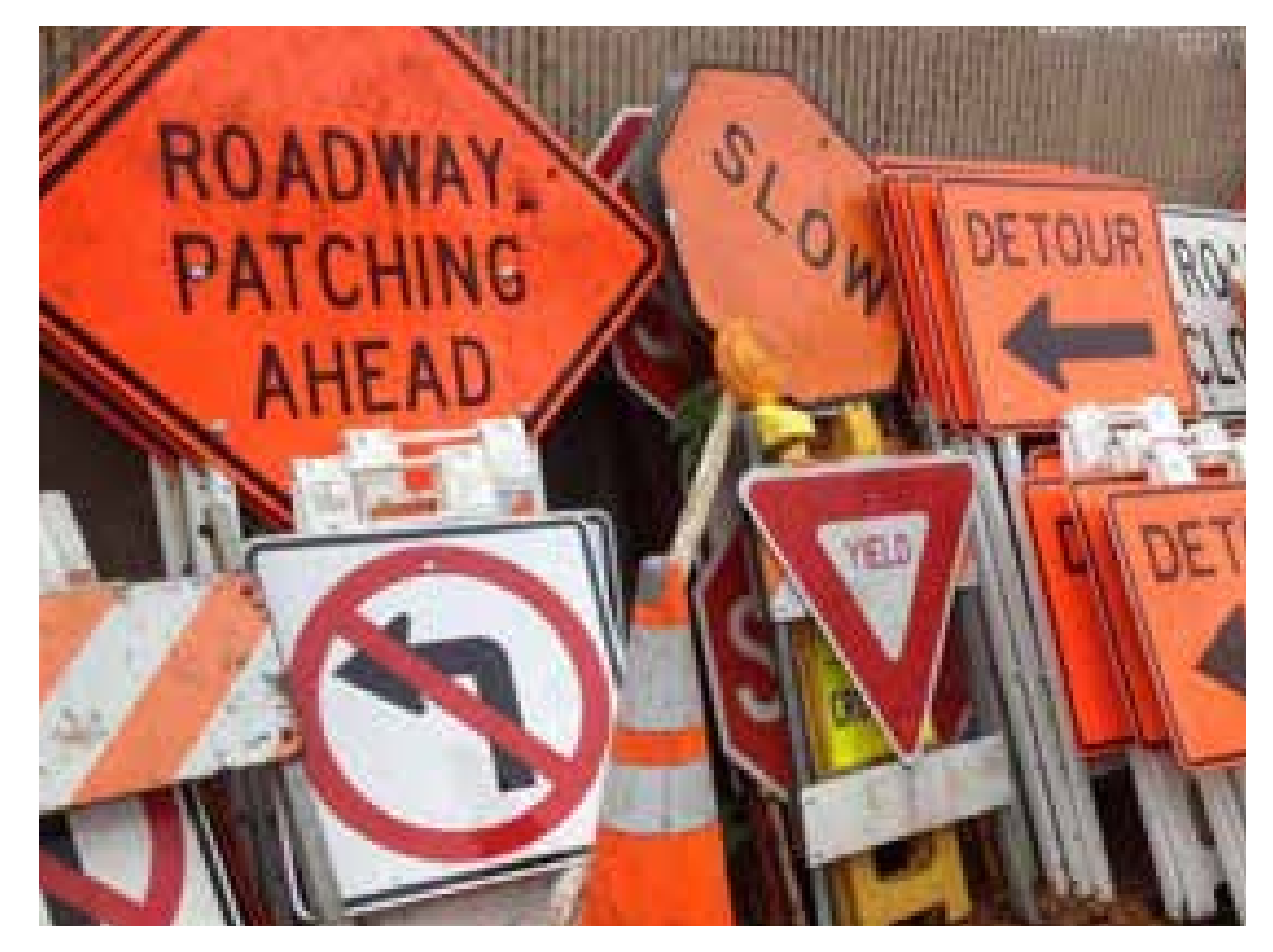
Signage will be provided directing all users to the selected detour. Flaggers will direct traffic as needed.