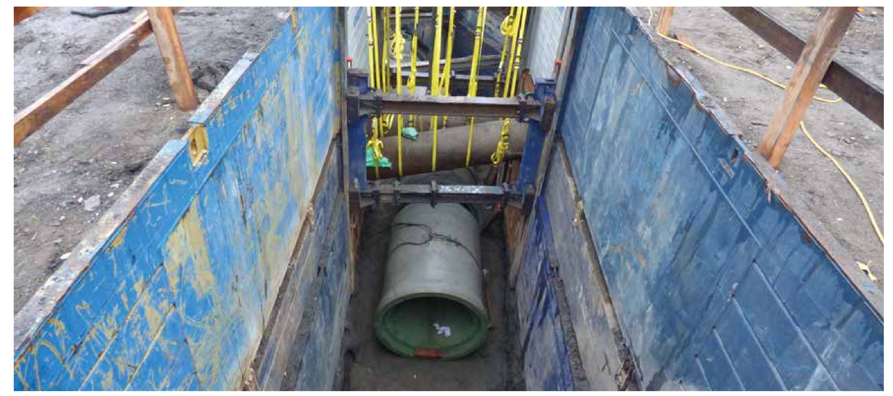
Example of open cut construction.

Crews will use open-cut trenching to lay pipe along the trail. In open-cut construction, crews dig from the surface to the pipe depth, lay the pipe, then cover the pipe and restore the surface. The work zone along the trail will be at least 26-feet wide to safely accommodate materials, equipment and construction workers. In some areas it may be wider.