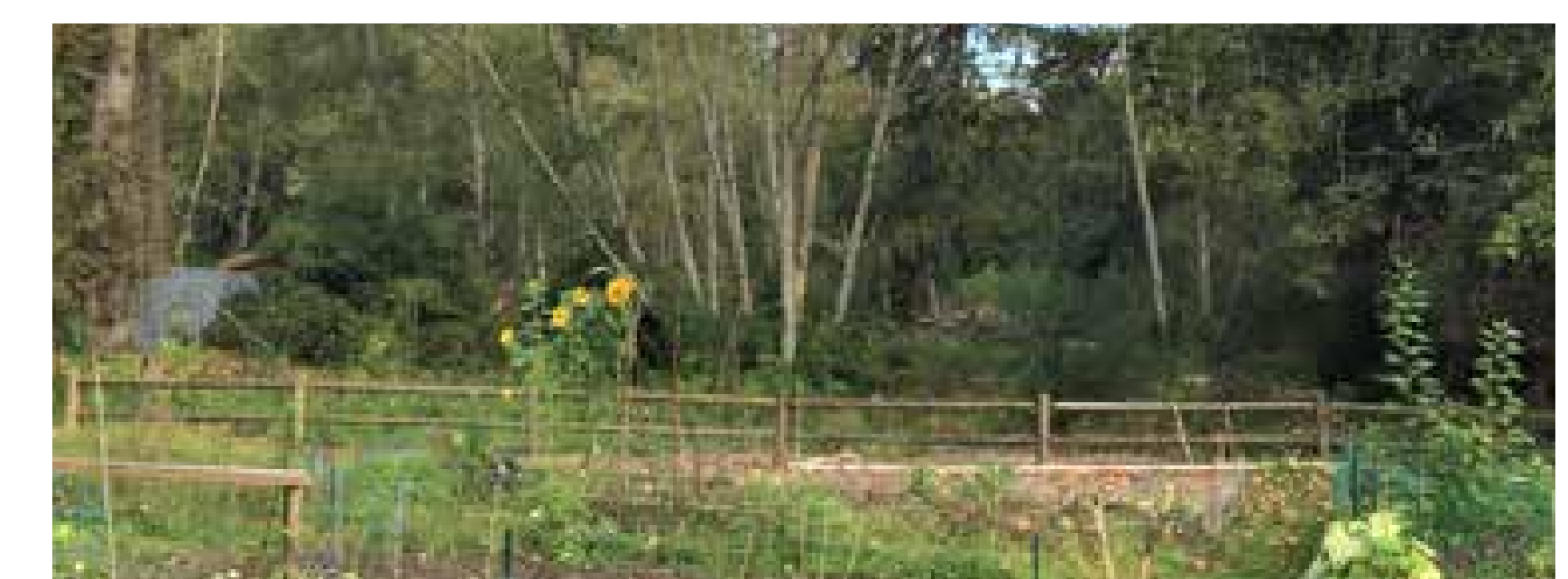
Example site after construction