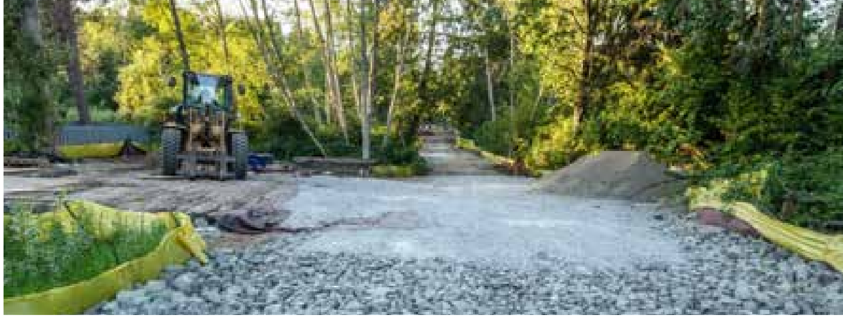
Example site during construction