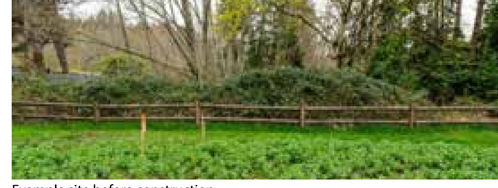
Example site before construction