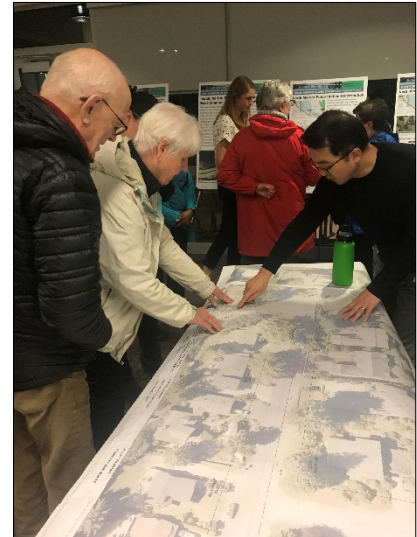
Project staff review project area map with open house participants.

The pipe will come off the I-90 Trail and follow 90th Place S.E. to keep wastewater flowing efficiently. In the cul-de-sac at the end of 90 th PL S.E., the force main that pushes sewage from the North Mercer Pump Station will transition to a gravity pipeline that allows sewage to flow downhill to the East Channel. At the transition point, there will be an underground discharge structure and odor control