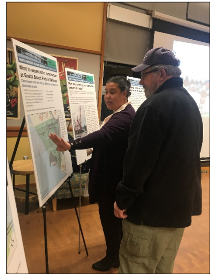
Project team members talk with an attendee about project details.